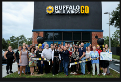
Buffalo Wild Wings GO - Ribbon Cutting Charlotte County Chamber of Commerce August 28, 2024