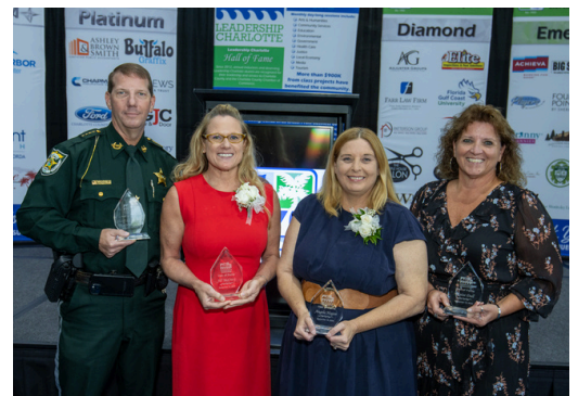
Leadership Charlotte Hall of Fame Inductees (above), and nominees (below)