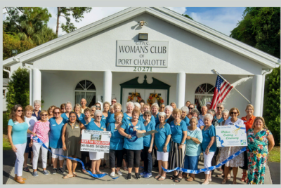
GFWC Woman's Club of Port Charlotte - Ribbon Cutting Charlotte County Chamber of Commerce September 6, 2024