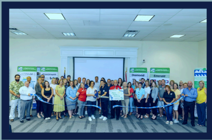
Clique Photo Booth Rental - Ribbon Cutting Charlotte County Chamber of Commerce September 18, 2024