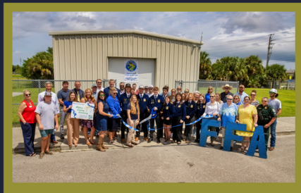
FFA Ag Feed Store - Ribbon Cutting Charlotte County Chamber of Commerce August 21, 2024