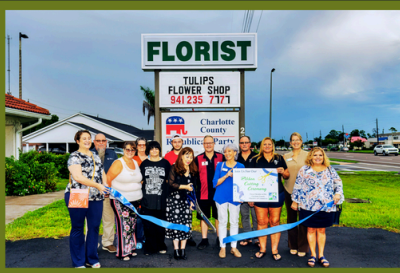
Tulips Flower Shop - Ribbon Cutting Charlotte County Chamber of Commerce September 4, 2024