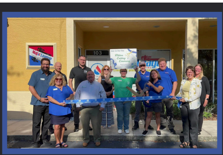
Major League Plumbing - Ribbon Cutting Charlotte County Chamber of Commerce August 13, 2024