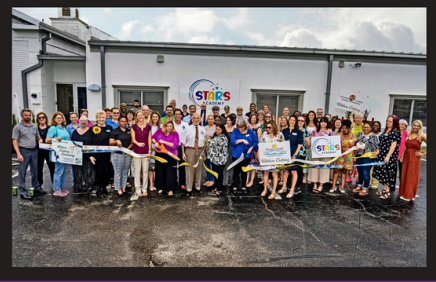
Stars Academy/Gulf Coast Partnership - Ribbon Cutting Charlotte County Chamber of Commerce July 11, 2024