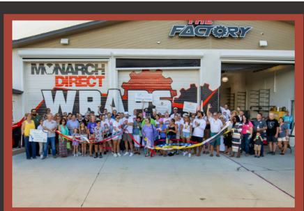
MonarchDirect The Factory - Ribbon Cutting Celebration Charlotte County Chamber of Commerce August 1, 2024