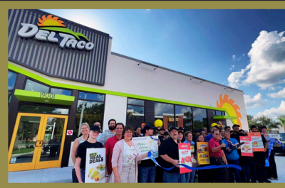
Del Taco - Grand Opening & Ribbon Cutting Charlotte County Chamber of Commerce September 17, 2024