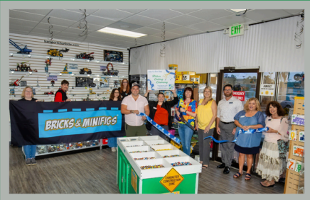
Bricks & Minifigs - Ribbon Cutting Celebration Charlotte County Chamber of Commerce July 22, 2024