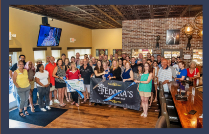
Fedora's Cigar & Wine Bar - Ribbon Cutting Charlotte County Chamber of Commerce August 16, 2024