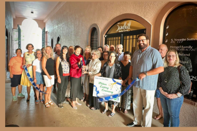
Sandhill Healing Center, Inc. - Ribbon Cutting Charlotte County Chamber of Commerce September 24, 2024