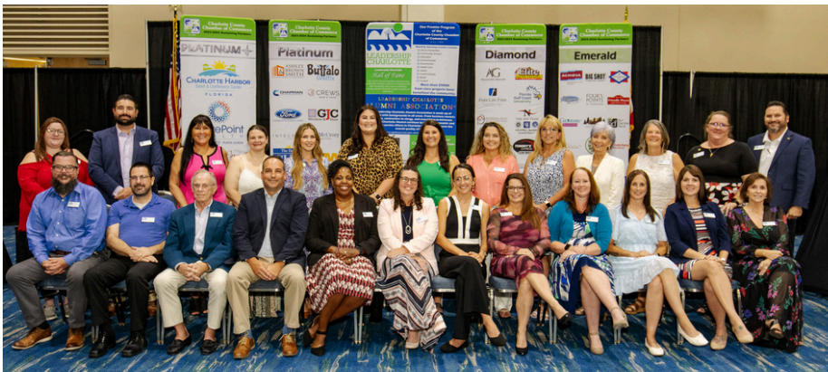
Leadership Charlotte Class of 2025