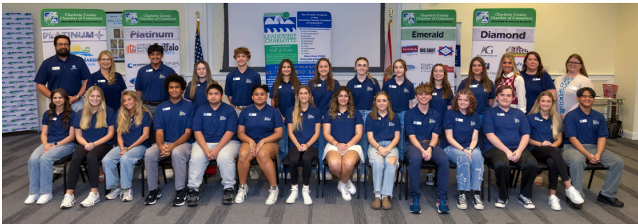
Junior Leadership Charlotte Class of 2025