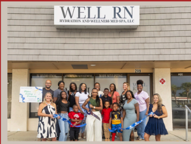
Well RN Hydration and Wellness Med Spa, LLC - Ribbon Cutting Charlotte County Chamber of Commerce September 18, 2024