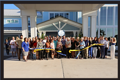
The Meridian at Punta Gorda Isles - Ribbon Cutting Charlotte County Chamber of Commerce October 29, 2024