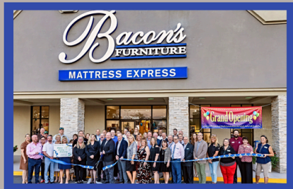
Bacon's Furniture Galleries - Grand Reopening & Ribbon Cutting Charlotte County Chamber of Commerce November 14, 2024