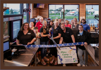
Elianos Coffee - Ribbon Cutting Charlotte County Chamber of Commerce October 3, 2024