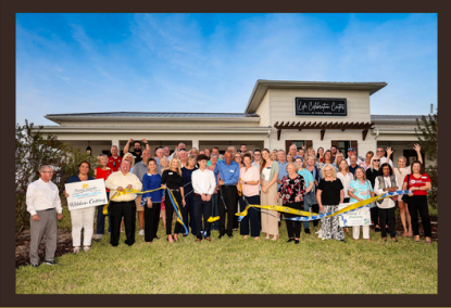
Life Celebration Center - Ribbon Cutting Charlotte County Chamber of Commerce November 8, 2024