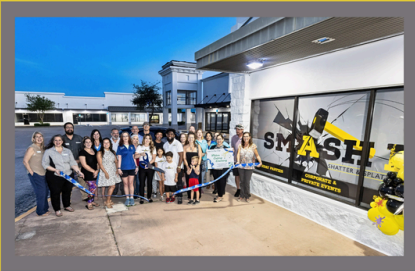
Smash It - Grand Opening & Ribbon Cutting Charlotte County Chamber of Commerce November 13, 2024