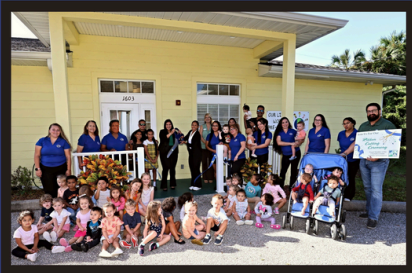
Little World Academy - Ribbon Cutting Charlotte County Chamber of Commerce October 21, 2024