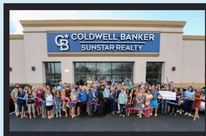
Coldwell Banker Sunstar Realty - Ribbon Cutting Charlotte County Chamber of Commerce October 30, 2024