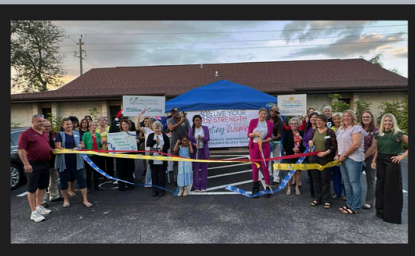
Live Your Strength - Ribbon Cutting Charlotte County Chamber of Commerce December 17, 2024